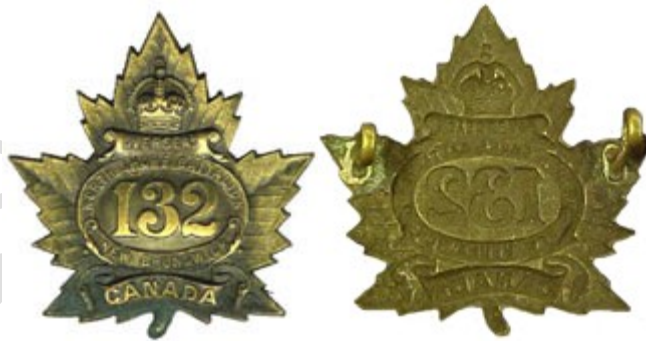
632-11-116 Cap Pickled finish. Lug fasteners. Not maker marked