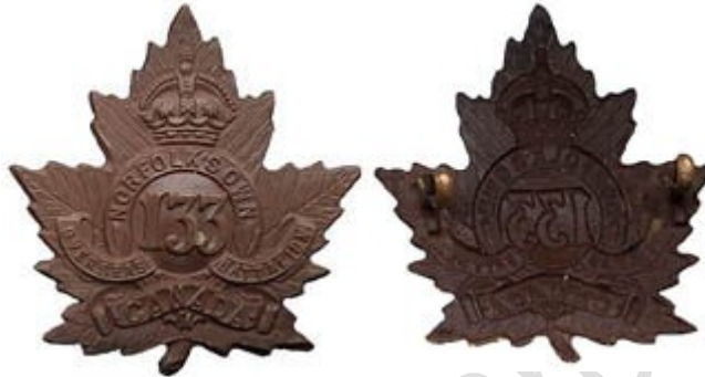
633-11-114 Cap Red/brown OSD. Lug fasteners. Not maker marked