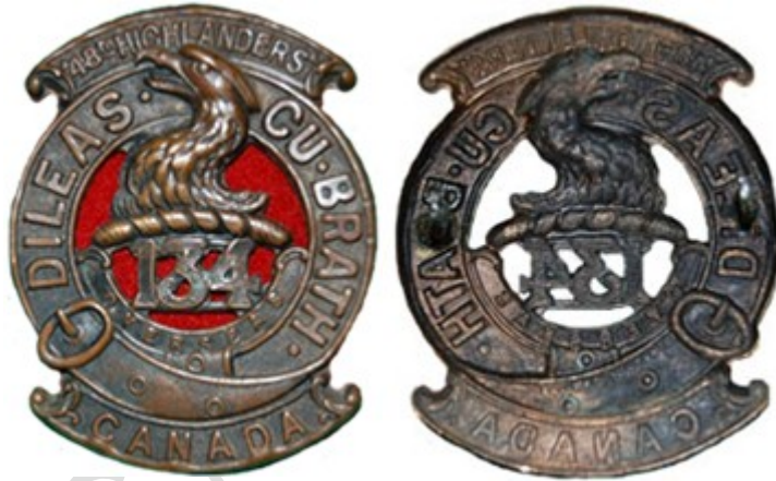
634-11-106 Cap Brown finish. Round wire lug.s Maker marked 'P.W.Ellis & Co. Toronto'