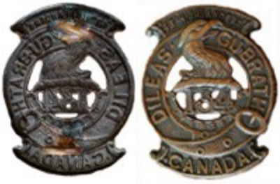
634-12-104 Collar Brown finish. N/S/ Flat cut sheet copper lugs.. Not maker marked