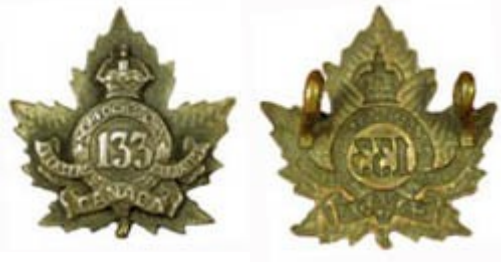
633-12-112 Collar Silver overlay on pickled finish. Lug fasteners. Not maker marked