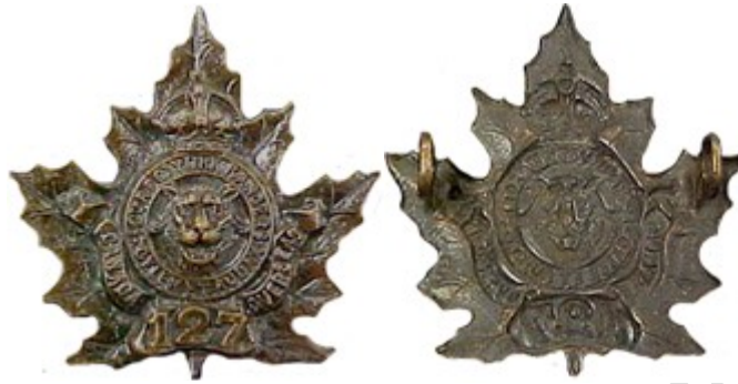
627-11-102 Cap Brown finish. Lug fasteners. Maker marked Ellis Bros