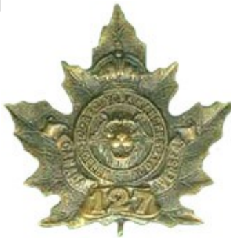
627-11-104 Cap Pickled finish. Lug fasteners. Maker marked Ellis Bros