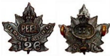
626-12-102 Collar Brown finish. Lug fasteners. Maker marked 'P.W. Ellis & Co. Toronto'