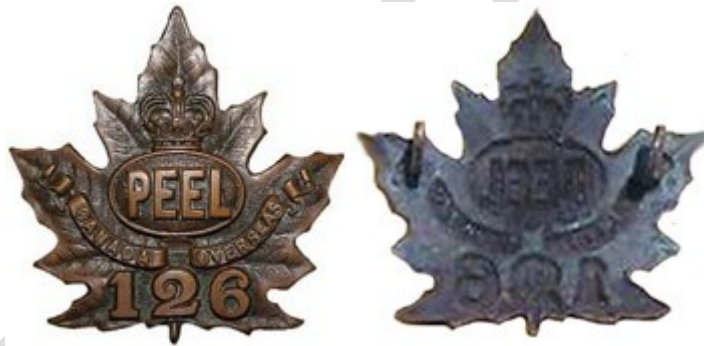
626-11-102 Cap Brown finish. Lug fasteners. Maker marked 'P.W. Ellis & Co. Toronto'