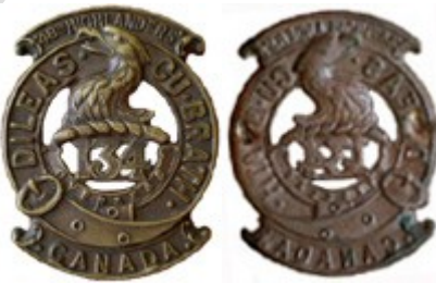
634-12-106 Collar Brown finish. Round wire lugs. Not maker marked