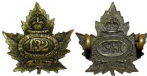
632-12-116 Collar Pickled finish. Lug fasteners. Not maker marked